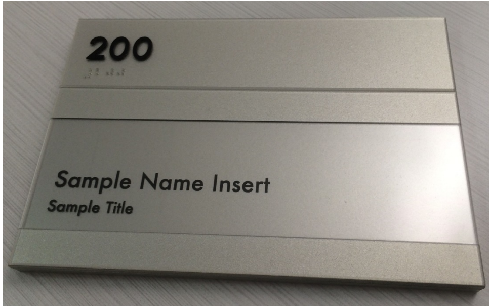
N2 SIGN Insert: 2 ½" x 8 ½"