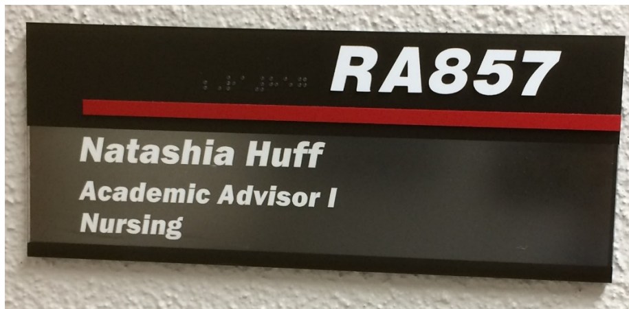
SMALL INFORMATIONAL SIGN Insert 2" x 10"

There are two commonly used insert holders in use at the University. There is an older type known as an "Informational" sign. It comes in two versions, a 'Small Informational' (SI) and a 'Large informational' (LI) sign. They look like this: